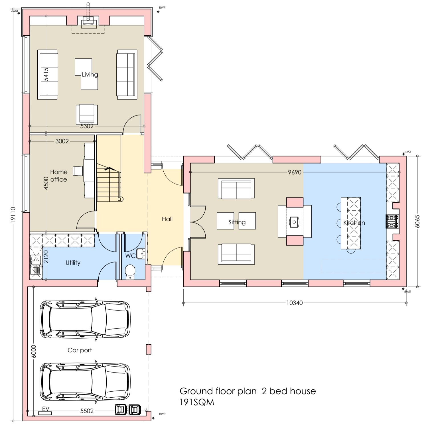
Ground floor plan 2 bed house 1915SQM