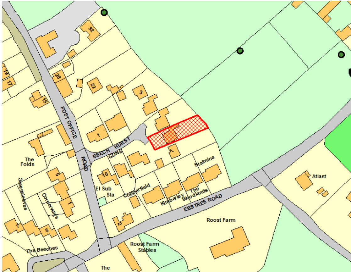
6 Beech Hurst Gardens, Seisdon, WOLVERHAMPTON WV5 7HQ