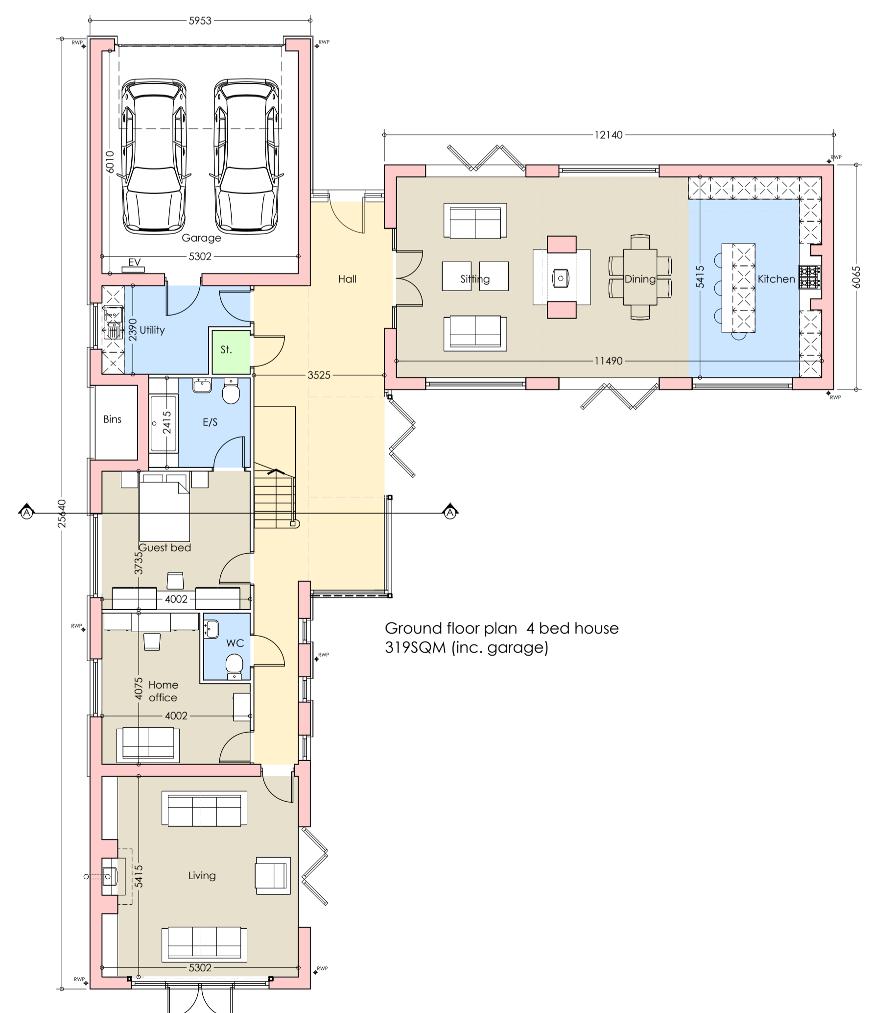
Ground floor plan 4 bed house 3195SQM (inc. garage)